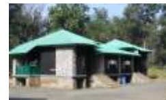
Baghira Log Huts