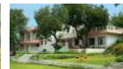
Motel Marble Rocks***