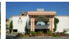
Palash Residency ***