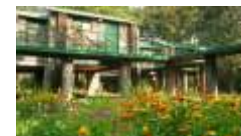
White Tiger Forest Lodge